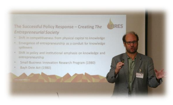
FIGURE 1: DAVID AUDRETSCH

efforts to revive the old, managed industrial economy, the engine of growth turned out to be the vibrant entrepreneurial economy that emerged in Silicon Valley and elsewhere. Although there were policies supporting this, at the time there was no intended design. The entrepreneurial economy emerged more than it was the result of supporting policy initiatives.