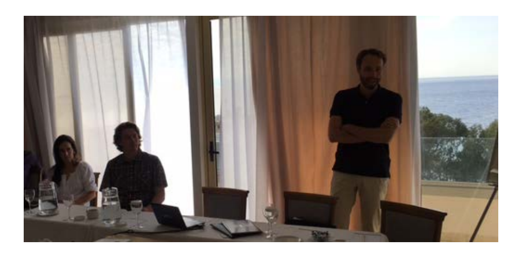
D3.9: Fritsch: Institutions, Entrepreneurship, and Wellbeing

development are related, we do not know enough about how institutions – as a fundamental cause of economic growth – affects growth via entrepreneurship, and which types of entrepreneurship result in productive effects on the macro level. The paper was already submitted and rejected at Small Business Economics Journal. The paper was well received in the session. Discussants in the session suggested to make more clear why particular types of institutions do matter for explaining the relation of entrepreneurship with economic growth, and also suggested some refinements of the empirical analyses. These suggestions are taken into account in a revised version of the manuscript submitted to the Small Business Economics Journal